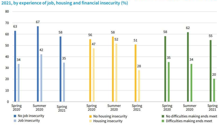
Figure 41: Proportions of people aged 18-29 feeling optimistic about their own future, spring 2020 to spring

Moreover, young people are relatively pessimistic about the future. The graph below, produced by Eurofound in the wake of the COVID-19 pandemic (between 2020 and 2021), illustrates young people's growing uncertainty about their own future.